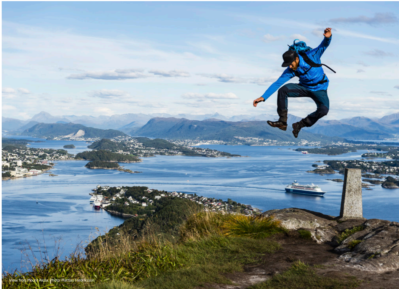
View from Mount Aksla.