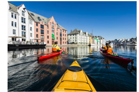
Kayaking in Ålesund.

A factory outlet steeped in history to inspire our guests as they shop, visit our artists, or try other activities.