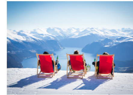
View from the front row, Strandafjellet.

Runde Island is the southernmost bird cliff in Norway. The Runde environmental centre has a large