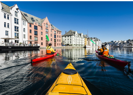
Kayaking in Ålesund.

Ålesund Guide Association Explore the town with a local authorized guide possessing in-depth local knowledge.