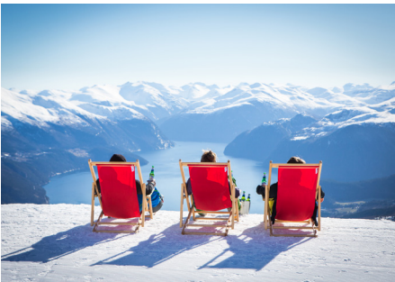
View from the front row, Strandafjellet.

Devoldfabrikken A charming area for a tour among cultural heritage with 170 years of Devold Wool garments. Many historical elements still visible. The tour will take you to the small museum, visiting the art studios. A charming area with a combination of outlet stores, unique niche shops, a café, museum, art and crafts, and an indoor activity park for children.