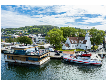
FONN floating fish market and the 400- year-old church

The light part of the moon consist of anorthosite, which is a rare type of rock here on earth, but is