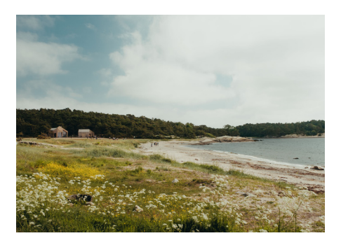
he Hvaler Archipelago.