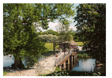
he Fortress Town.

Outdoor experience with a leisurely paddling tour in the beautiful nature of the Hvaler Archipelago. Few places compare to the beautiful Hvaler islands, with their glittering waves, wonderful beaches, and stunning archipelago. Tours for all levels of paddlers with experienced instructors guiding you through a calm an enjoyable experience in the beautiful archipelago, guaranteeing a close encounter with nature