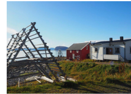
Fuglenesodden Friluftsmuseum: Museene for kystkultur og gjenreising i Finnmark

For anyone wishing to discover Hammerfest by foot, our walking tour in the town centre is the best choice. We start at the Tourist Information and visit the protestant church of Hammerfest with its special architecture, which is a reference to one of our oldest traditions. We continue to the Museum of Reconstruction. The exhibition here portrays events from World War II in the north of Norway and how this region was reconstructed afterwards. You will see how the powers of endurance showed in that period, dating back to the olden days of Arctic hunting and fishing in Hammerfest, by