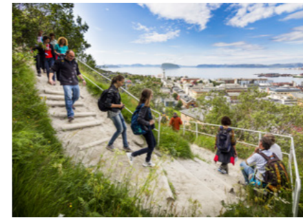
Zigzag-Path Hammerfest.

On this shore excursion, you can experience the beauty of Arctic coastal nature. We depart from the cruise pier in Hammerfest by coach. On the way to the fishing village of Havøysund, we will drive along the northernmost National Scenic Route, which is highly frequented by tourists year-round due to its amazing scenic views. After a stop at the viewpoint on Havøya, we visit Havøysund Hotel to have lunch. After a 250 m-walk to the pier, we head back to Hammerfest. The 1.5-hour trip leads through scenic sounds as you pass the islands of west Finnmark.