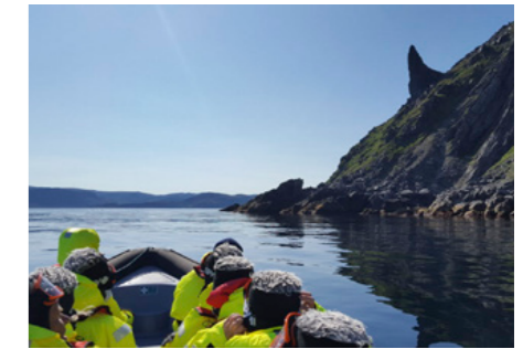
RIB adventures.

We take you to Mount Salen by bus, where we find the northernmost disc golf course in the world. After a round of throwing discs into baskets in a wide and open landscape, we will enjoy the view at the edge of the mountain with spectacular photo opportunities of the town. Footwear and clothing: Sturdy, comfortable shoes and warm clothes.