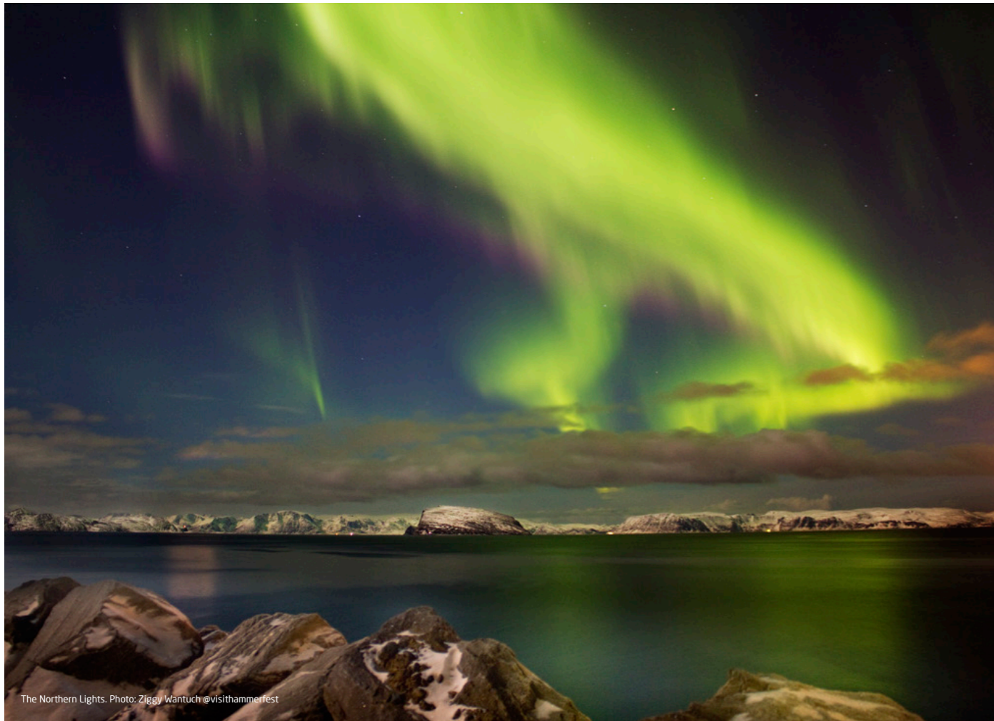
The Northern Lights.