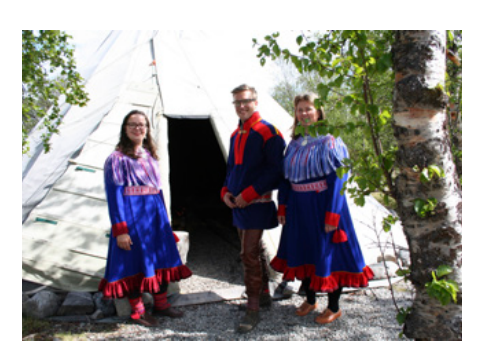
The Sámi's 8 seasons.

Duration: 2.5 hours Capacity: 50 Season: June - October