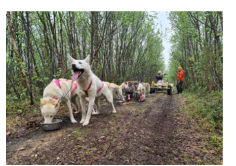
Dog sledding.

Duration: 2.5 hours Capacity: 8 Season: June - October Porsangerfjorden is mainland Europe's northernmost archipelago. Join us out in the clear Arctic water for a guided kayak trip. Experienced guides with safety