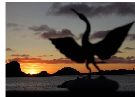
Sund Fiskerimuseum Smeden i Sund

Lofoten Links at Hov offers a quality 18-hole championship golf course in a spectacular setting beside the sea, facing north and the Midnight Sun. Next to the golf course is Hov Gård which offers riding trips on Icelandic horses both summer and winter. Lunch available at Låven Restaurant. Website: lofotenlinks.no