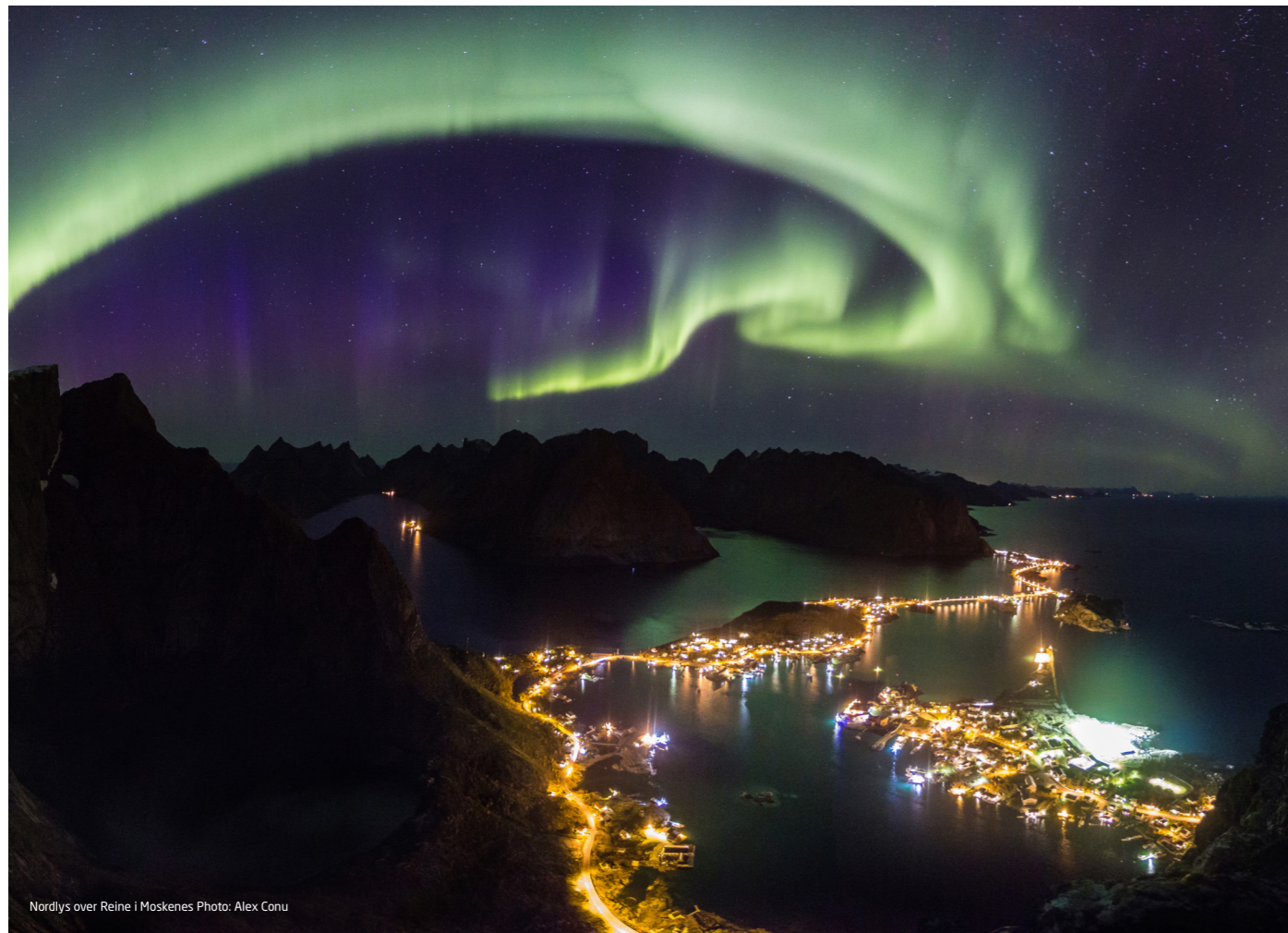
Nordlys over Reine i Moskenes