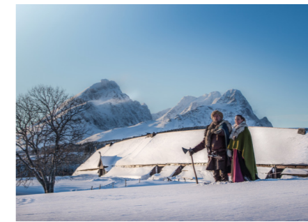
Lofotr Vikingmuseum

Lofoten Gaver & Brukskunst offers the widest selection of souvenirs and gifts in Leknes, ranging from traditional souvenirs to locally produced marmalade and knitted products. The shop accepts foreign currency and all major credit cards. The store is a Global Blue retailer, which offers