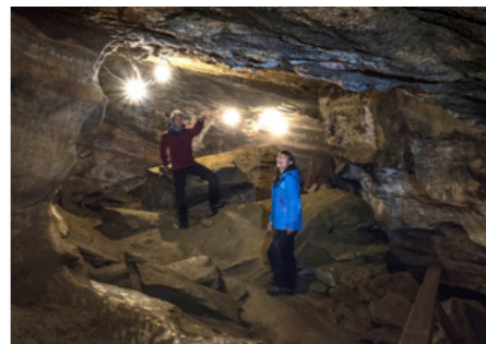
Exploring the Grønligrotta cave.