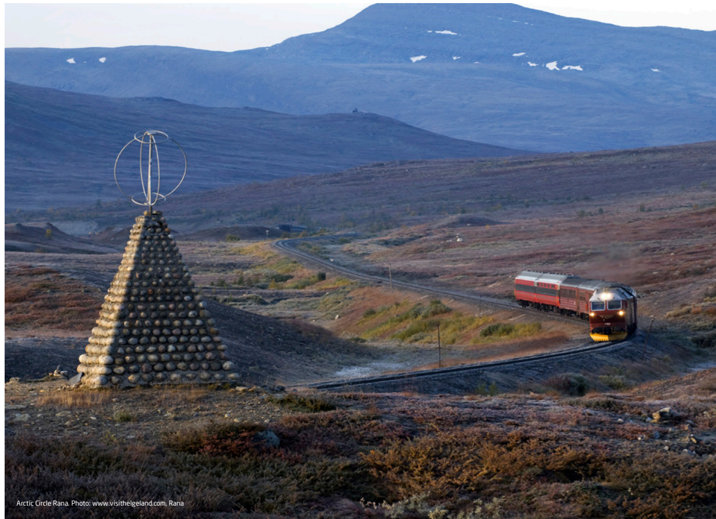
Arctic Circle Rana. Photo: www.visithelgeland.com, Rana