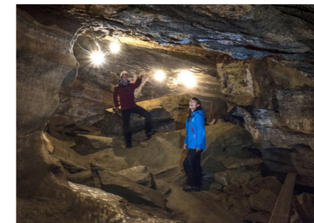
Exploring the Grønligrotta cave.

Duration: 6 hours Starting in Mo i Rana, you will take a bus to Hemavan/Tärnaby in Sweden, an extremely popular winter destination. Summertime offers the chance to view the area's vast botanical treasures and local culture. Lunch will be served at one of the restaurants in Hemavan, where you will also hear the story of Swedish downhill champions Ingemar Stenmark and Anja Persson. This excursion is by bus. Capacity: 20-200 pax.