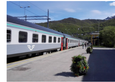
The Ofoten Railway

The Aurora Borealis, also called the Northern Lights, is only visible in the Northern Hemisphere in the period September to April. However, the best time is from October until February. We can offer several excursions where we hunt for this incredible natural phenomenon, hopefully leaving you with memories of a lifetime.