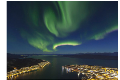
Northern Lights at the lodge.

Skjomen is known for its scenic and volcanic terrain with high, steep mountains and clear water. The Frostisen glacier, which is one of the larger plateau glaciers in Norway, is located just west of the fjord. Skjomen is also home to an 18-hole golf course where you can enjoy a round of golf, go to the driving range or just have some silly games for fun.