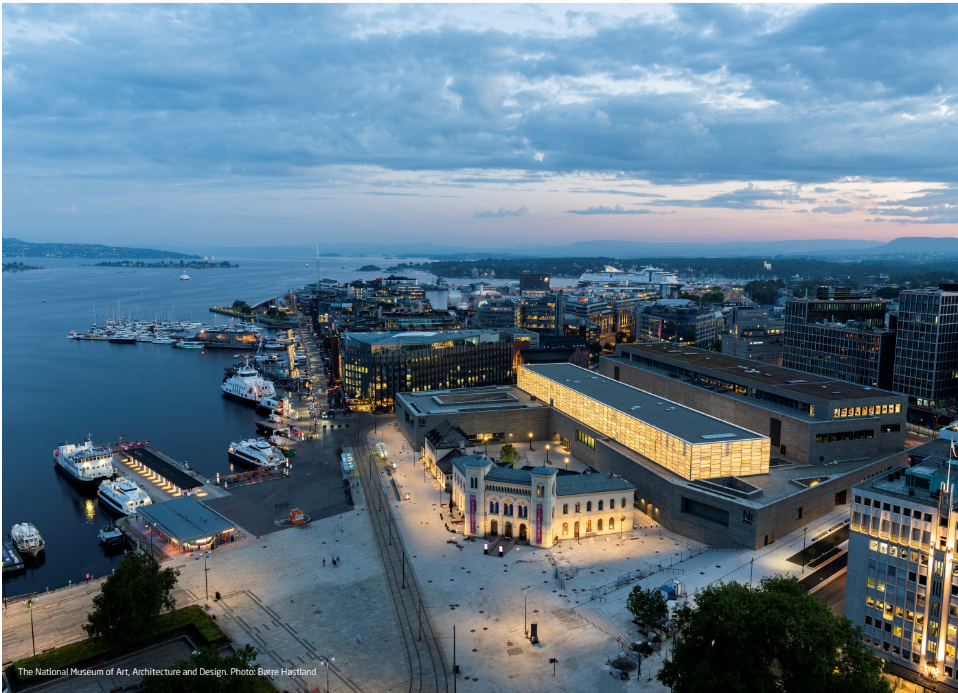
The National Museum of Art, Architecture and Design.