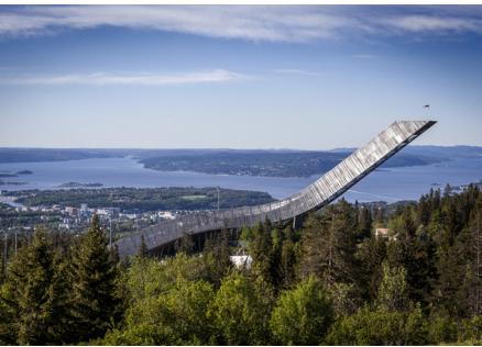
Holmenkollen Ski Jump and Ski Museum.

An art centre featuring the work of the sculptor and painter Tore Bjørn Skjølsvik. The gallery is located in a property, next to the Royal Palace, that includes a villa and a former stable, surrounded by a lush sculpture garden. With its idyllic setting, sculpture garden and the ambience of a working artist's studio, TBS Gallery is a gallery for all seasons and welcomes visitors throughout the year. Some of the sculptures and paintings are on permanent display, while others are for sale.