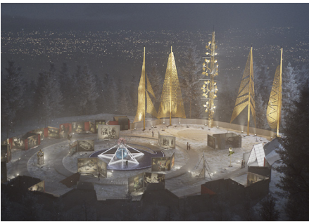
The Rose Castle

Ekebergparken is a sculpture and national heritage park, boasting a collection of sculptures and outdoor art installations of international standing. The art works are surrounded by beautiful scenery, with many spectacular lookout points. Ekebergparken is always open, and is free to visit.