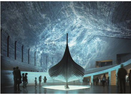
Viking Ship Museum.

The venerable Akershus Fortress is a great place to explore Oslo's history. The building of the fortress commenced in 1299 under King Håkon V. King