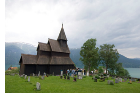
UNESCO Urnes stave church.

The Austrian Ludwig Wittgenstein (1889-1951) was