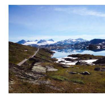
Jotunheimen National Park & Sognefjellet.

Safthuset is the old, restored jam and juice factory at