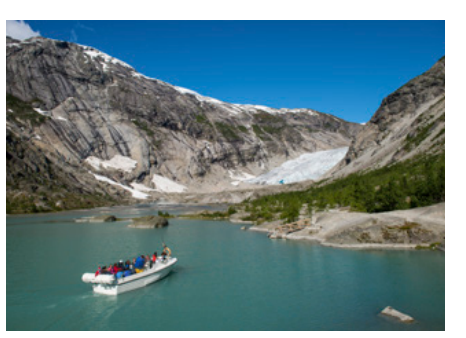
Nigards Glacier.

Åsafossen waterfall – 3 km from Skjolden Drivande waterfall - 8 km from Skjolden