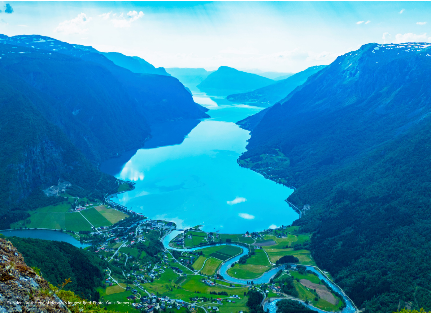
Skjolden - at the end of Norway's longest fjord.