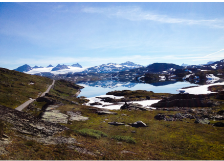
Jotunheimen National Park & Sognefjellet.

From authentic West to authentic East Distance: 83 km The Sognefjellet scenic route from Skjolden runs across the “roof of Norway” to the friendly village of Lom in the Gudbrandsdalen Valley, which is known for being an authentic and well preserved eastern Norwegian village.