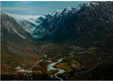
Nigards Glacier, Jostedalbreen National Park.

Feigefossen Waterfall Distance: 16 km Feigefossen is one of Norway's highest waterfalls, and the free fall of 218 m can be seen from the fjord, the Romantic Road and the National Tourist Route. There are also many other amazing waterfalls close to Skjolden, such as: Åsafossen Waterfall – 3 km from Skjolden Drivande Waterfall – 8 km from Skjolden