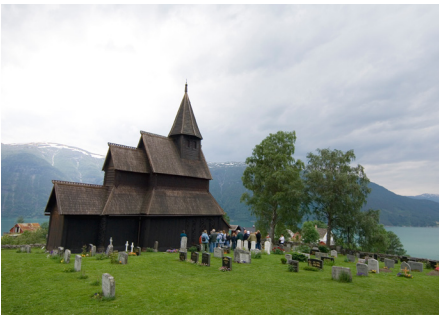
UNESCO Urnes stave church.

RIB boat tours Distance: 0,7 km Experience the magnificent Lustrafjord, surrounded by steep mountains and waterfalls. The tours take you on an unforgettable guided expedition in a secure and rigid inflatable boat (RIB).