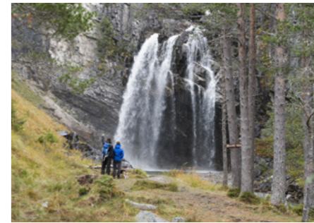
Nauståfossen, Todalen.

Hopsjø old trading centre (3,5-4,5 hrs) Bus excursion (35 min. drive) to an old trading centre (est. 1730) with so many interesting stories to tell! Visit the old general store with a great collection of ancient artefacts, see the whaling exhibition in the old warehouse, join a short trip on an old, restored boat, once used for herring fishing. Optional: Locally produced lunch in the old warehouse. Capacity: 10-90 pax.