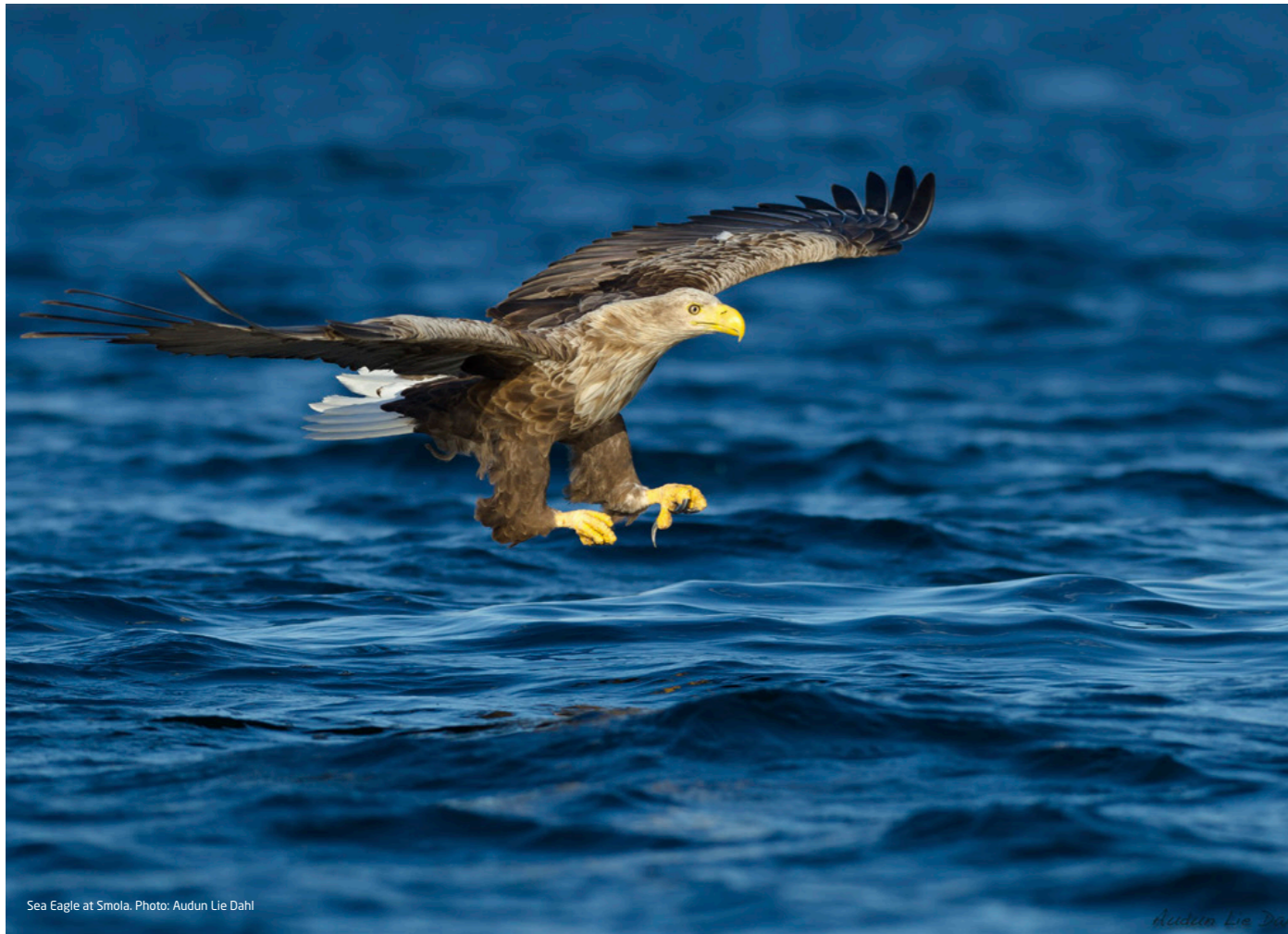
Sea Eagle at Smøla.