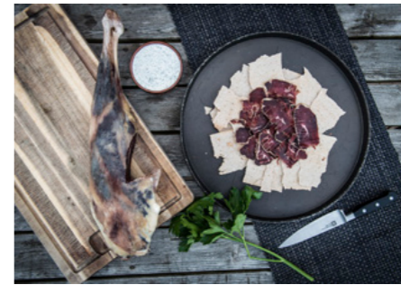
A taste of Hitra.

A Viking Experience (3,5 hrs) Bus excursion (30 min. drive) to idyllic Dolmsundet with a reconstructed Iron Age longhouse. Enjoy a cup of mead and the magical atmosphere around the camp fire, just like the Vikings did... Visit the nearby Dolm medieval church and admire the stunning views from the Dolmsund bridge. Optional: Iron age meal in the longhouse. Capacity 10-45 pax.