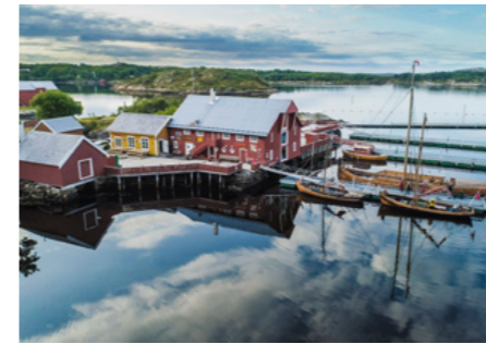
Hopsjø old trading centre, Hitra.

Other activities: • Kayaking in the archipelago • Smøla by bike • Golfing at Dyrnesdalen (6 holes) • Aquaculture Visitor Centre