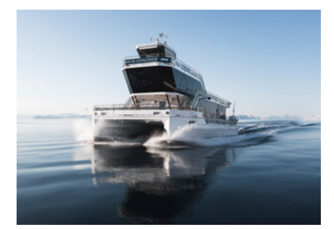
Hybrid-electric cruising in Isfjorden.

Eniov a culinary adventure and learn about both the historic and modern traditions in Longyearbyen.