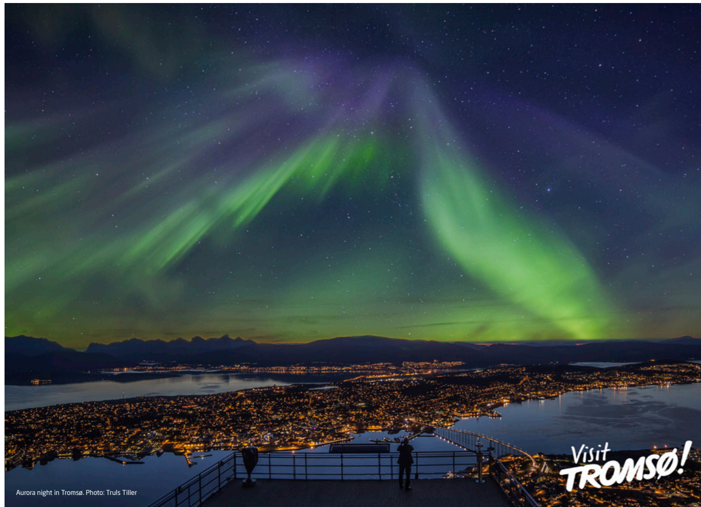
Aurora night in Tromsø.