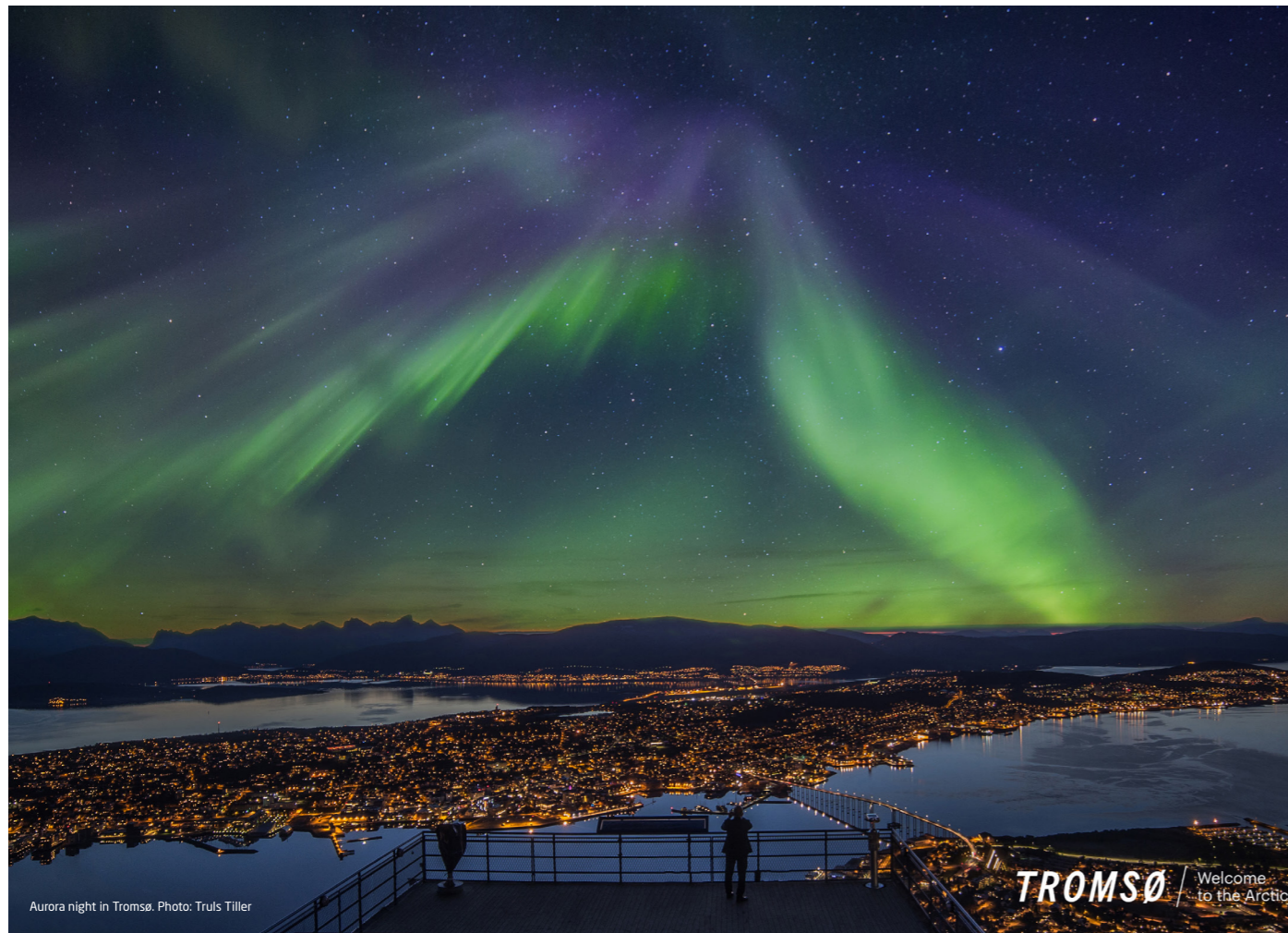
Aurora night in Tromsø.