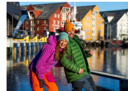
Walk along the harbour.

Northern Norway's most comprehensive museum presents in-depth knowledge about the people of the Arctic and their history as well as the Northern Lights.