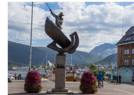
Tromsø city centre.

Blåst is an open workshop where you can get a demonstration of how glass is made. Like magic, glass is formed into fantastic products that make great gifts.