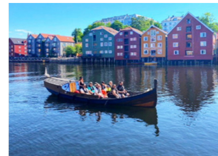
Boat ride along the wharves.

Duration: 4.5 - 8 hours Thamshavn Railway was built as the first electrical railway to transport ore from the copper mines at Løkken. The 1 km long route inside the mine takes you through narrow corridors and large caves. The historical train stops right outside Christian Thams self-designed manor and the newly returned Thams pavillion, a stave church building.