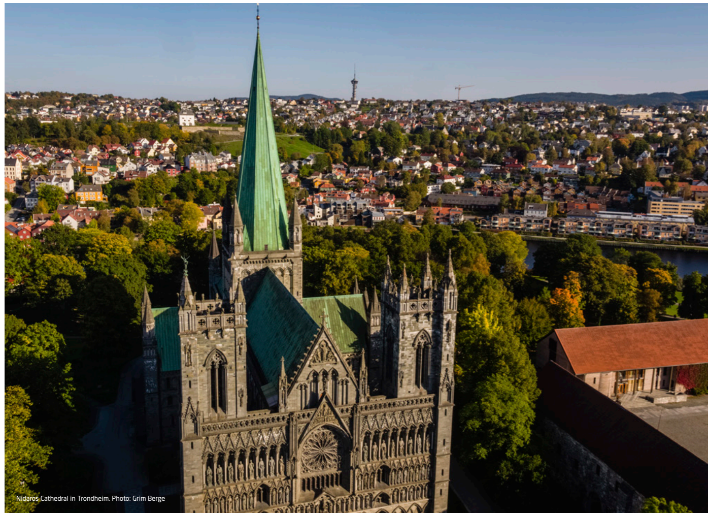
Nidaros Cathedral in Trondheim.