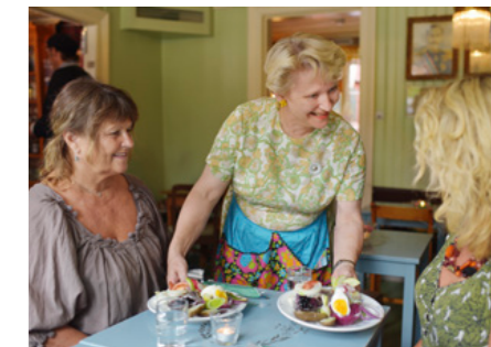
European Region of Gastronomy 2022.

Duration: 3-4 hours Trondheim was once the capital, but still houses the consecration church of the Norwegian Kings. Visit the Crown Jewels and the Royal Residence Stiftsgården (1 June - 18 Aug), to cover the full spectrum of Royalty.