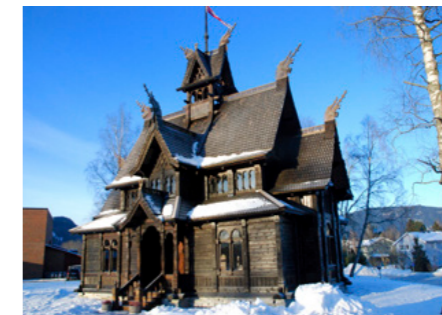
Thams pavillion.

Duration: 2 hours Kayak adventures are not solely for the wilderness. On this kayaking adventure you'll experience Trondheim's architecture and nature from water front and paddle along the famous wharves down the river Nidelven.