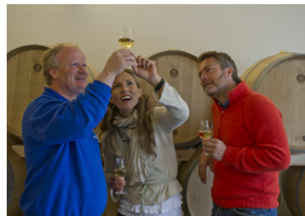
Apple Brandy Tasting.

Voss A tour to Voss by coach from Ulvik can include driving through orchards and forests, passing mountains and spectacular waterfalls. A stop at Skjervet waterfall is recommended. Visit Voss Folk Museum, a cluster farm situated at Mølster. The gondola, Voss Gondol, goes from the centre of Voss up to Hangurstoppen restaurant, 830 masl and can be included together with lunch or coffee. Return to Ulvik by coach. Duration 5 - 6 hours. Distance from port: 48 km (Voss).