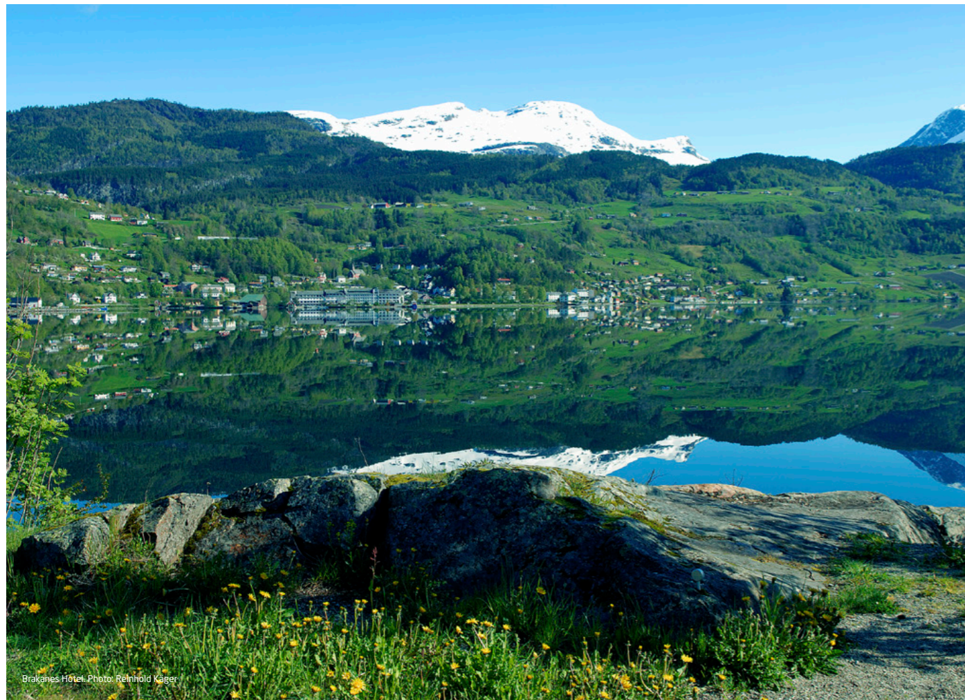
Brakanes Hotel.