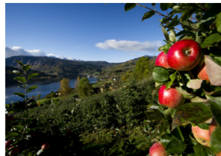
Apple trees in September.

Hikes and walks - duration from 1 hour Ulvik offers a wide range of guided hikes, walks and strolls, ranging from easy guided strolls in and around the village centre to longer and more strenuous hikes and walks in the surrounding hills. Walking distance: From 1 km