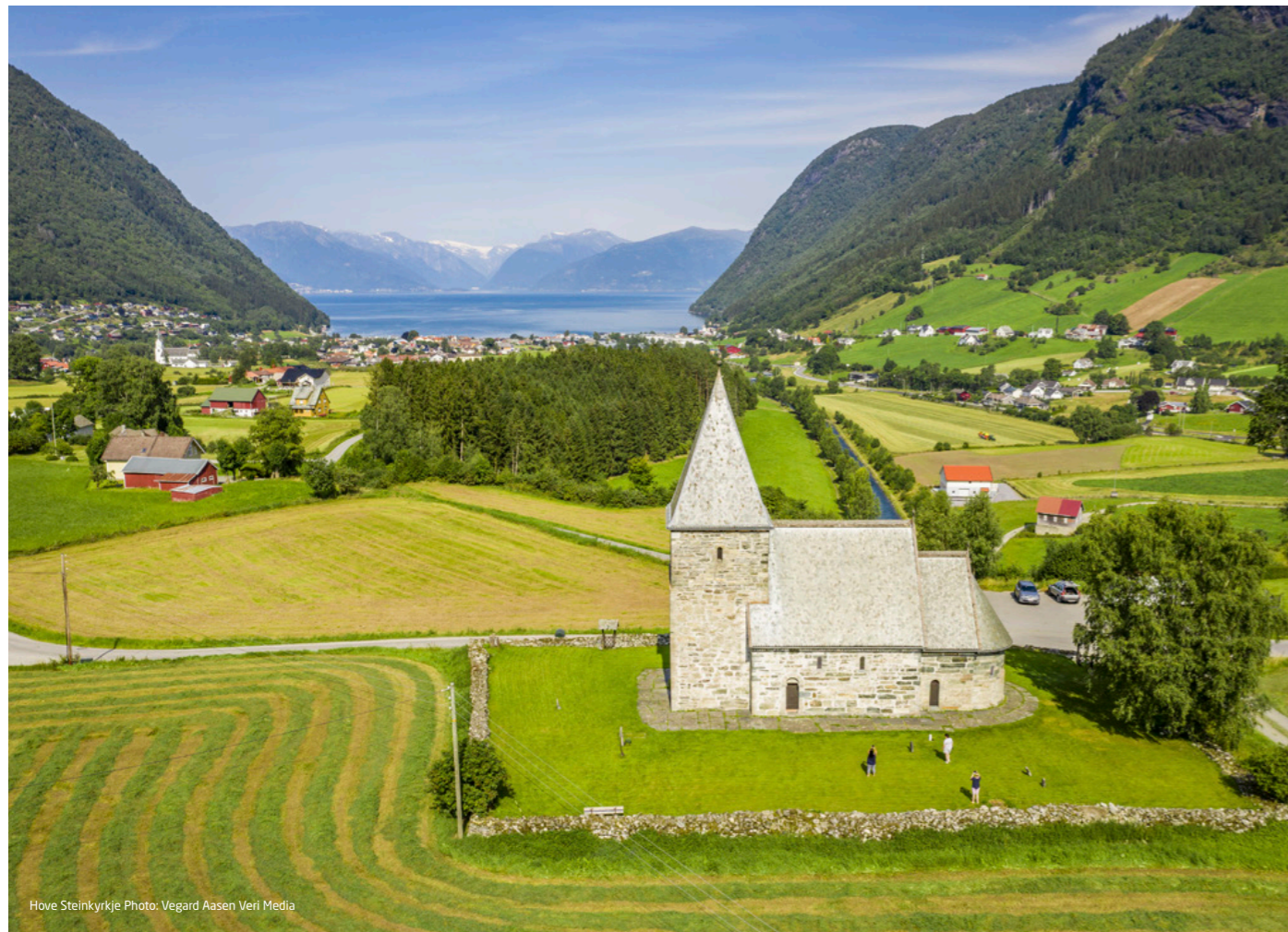
Hove Steinkyrkje