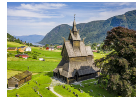
Hopperstad Stavekyrkje, Vik