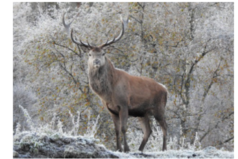
Visit a Deer Farm.