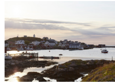
Sula Island at Frøya.

Duration: 2 hours Famous for its fresh fish and harbouring the two main salmon farms of Norway - Frøya is the cradle of local Norwegian food. In the restaurant Søværst, on top of the highest building in the town of Sistranda, you will have an amazing view over the islets and the mountains on the mainland. Here you will get a taste of the local beer and local food such as deer, wild sheep and salmon.