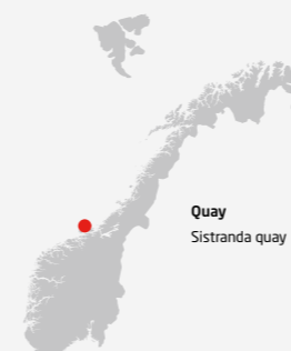
Quay Sistranda quay

Visiting address: Frøya kultur og kompetansesenter Postal address: Nordfrøyveien 411, 7260 Sistranda E-mail: turistinformasjon@froya.kommune.no Phone: +47 95 04 10 25 Web: www.hotellfroya.no/opplev-froya Distance from port: 700 m