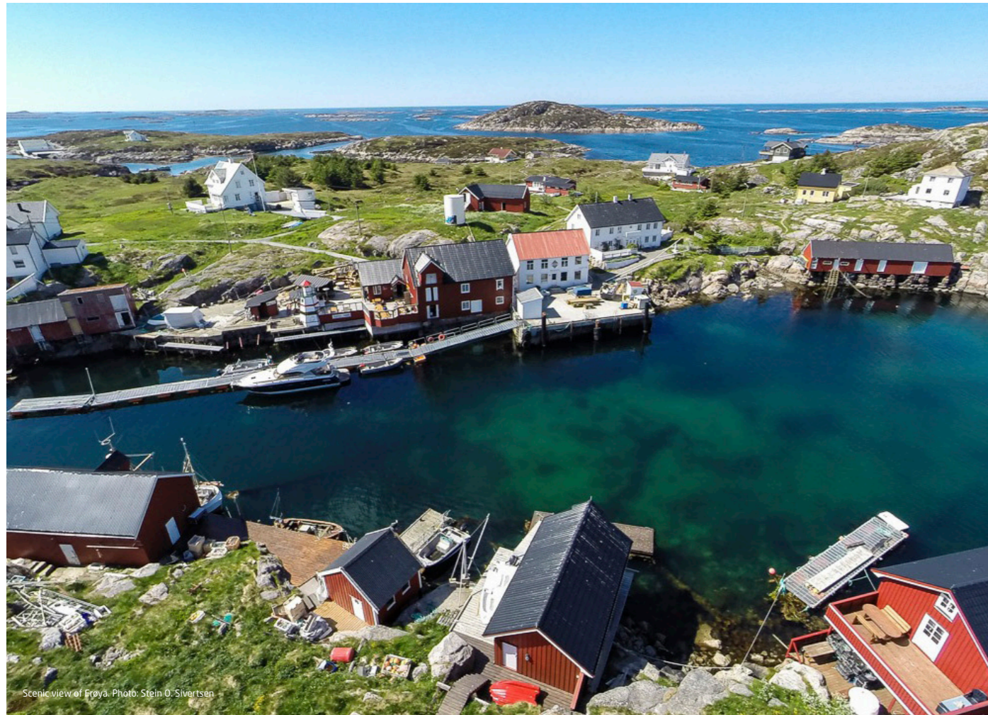
Scenic view of Frøya.