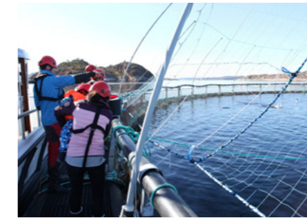
Salmon farm.